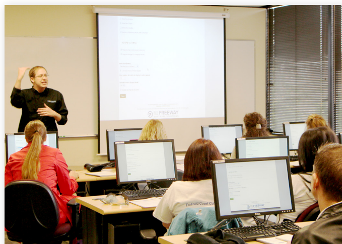
Leaf Data Systems